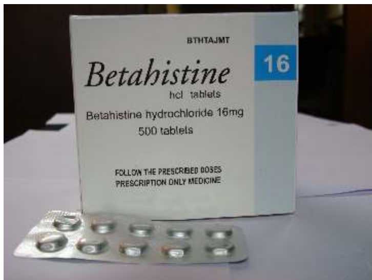
Betahistine hydrochloride Tablet

For Information about Generic Medicines : genericmedicines@tajpharma.com